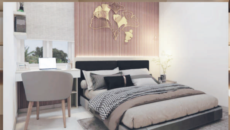
Design and Build (Home)

Contact Us for More Information 0813-2111-9745 (Agus Dwi)